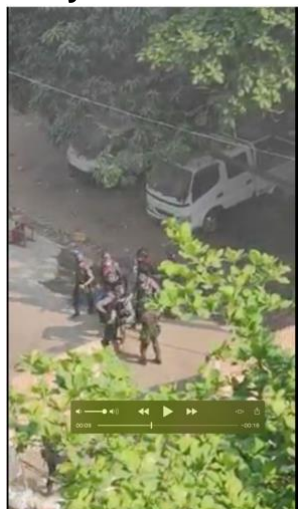
Police beating protestor

The remnants of the elected representatives have set up what amounts to an alternative administration called the National Unity Government (NUG) which functions on-line. The NUG has encouraged the establishment and training of a People's Defence Force to oppose the Tatmadaw. Thousands of mainly young people have now received military training by the Ethnic Armed Groups (EAOs) and an armed struggle is now underway. This was formally stated with a 'declaration of war' by the NUG on September 7th 2021. A low level insurgency is taking place across the country and there is heavier fighting in areas controlled by EAOs in Kachin and Karen States.